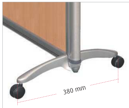
Double foot with castors (optional) mobile foot ideal for configurations to divide areas