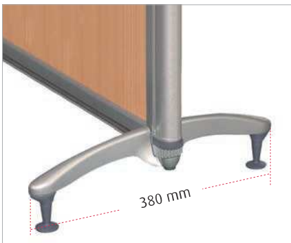
Double foot with levellers (optional) ideal for configurations to divide areas