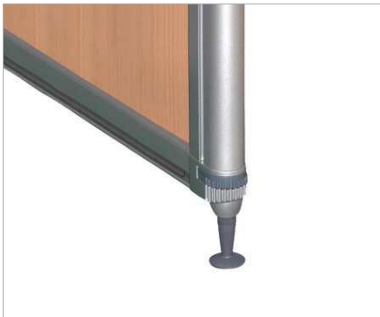
Levellers each module includes 2 levellers as standard