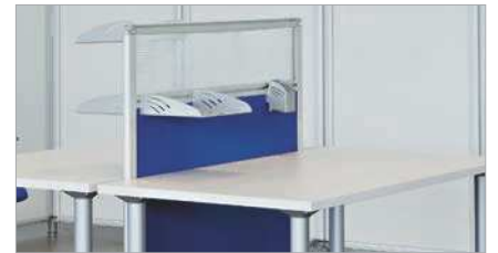
3ed level accessories and melamine shelves