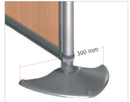
Flat foot (optional) for aisles where people passing through