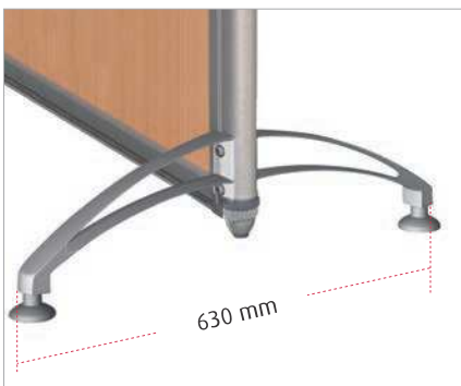
Double foot (optional) required when using shelves at both sides