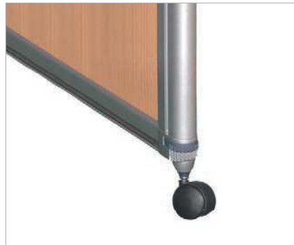
Castors (optional) for mobile screens