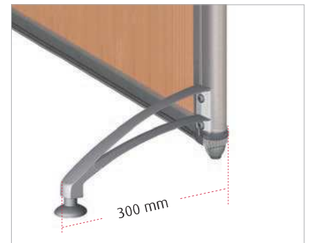
Single foot (optional) required when using shelves only at one side